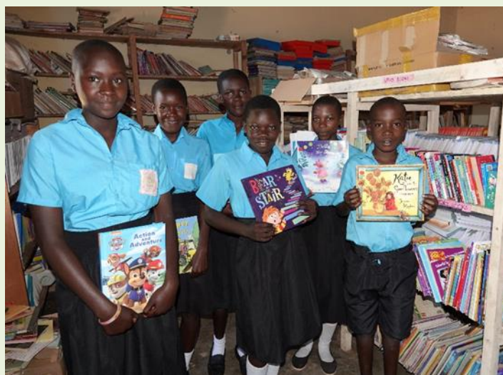
Year 6 children in the library